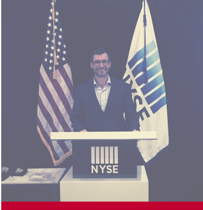
Speaking at the New York Stock Exchange - Sep 2017